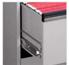
Heavy duty runner