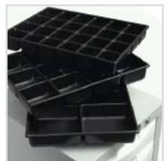
Draw compartment inserts available