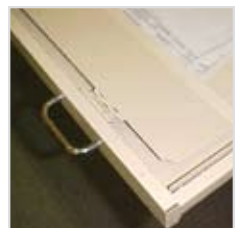
Inside draw detail