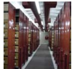
High density storage