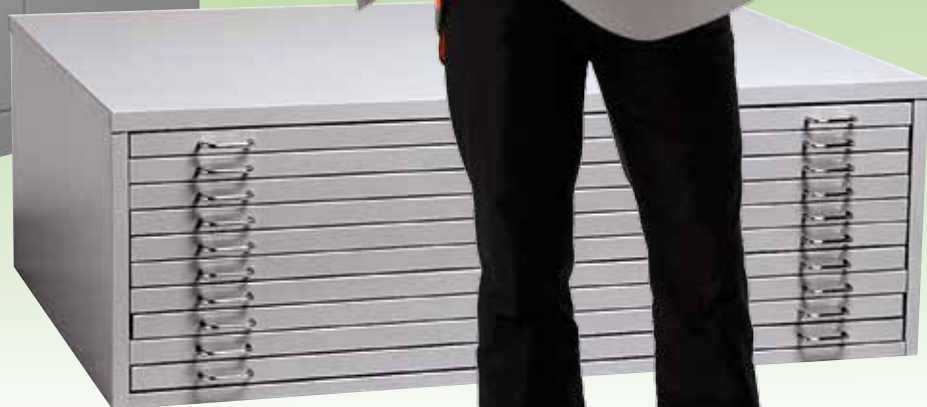
Precision 10 drawer Plan Cabinet