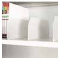
shelf divider - solid