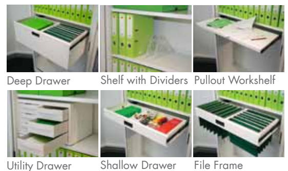
Deep Drawer Shelf with Dividers Pullout Workshelf