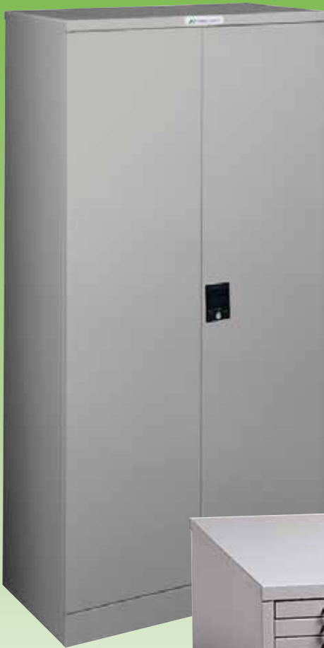
Precision Cupboard 1980h