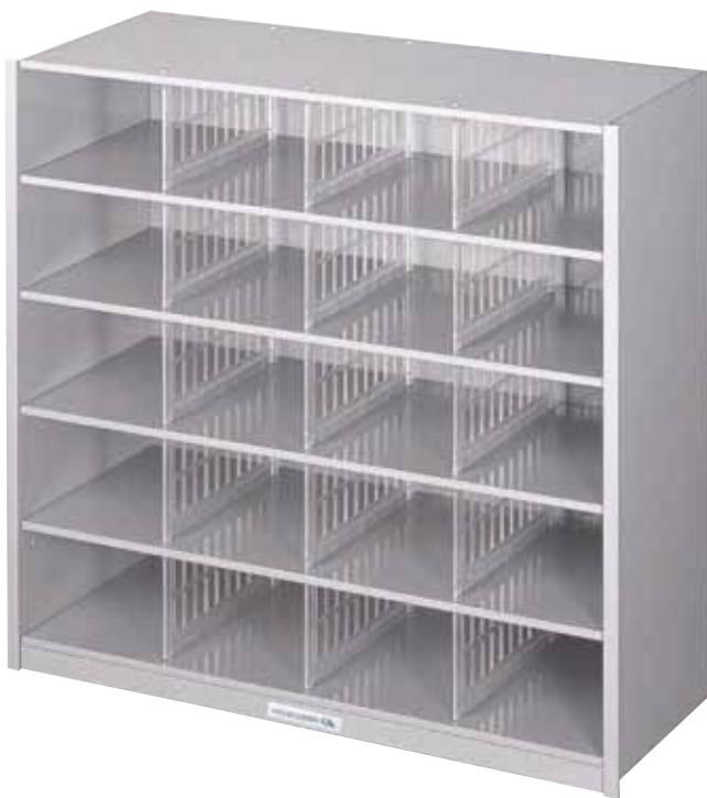
20 hole unit