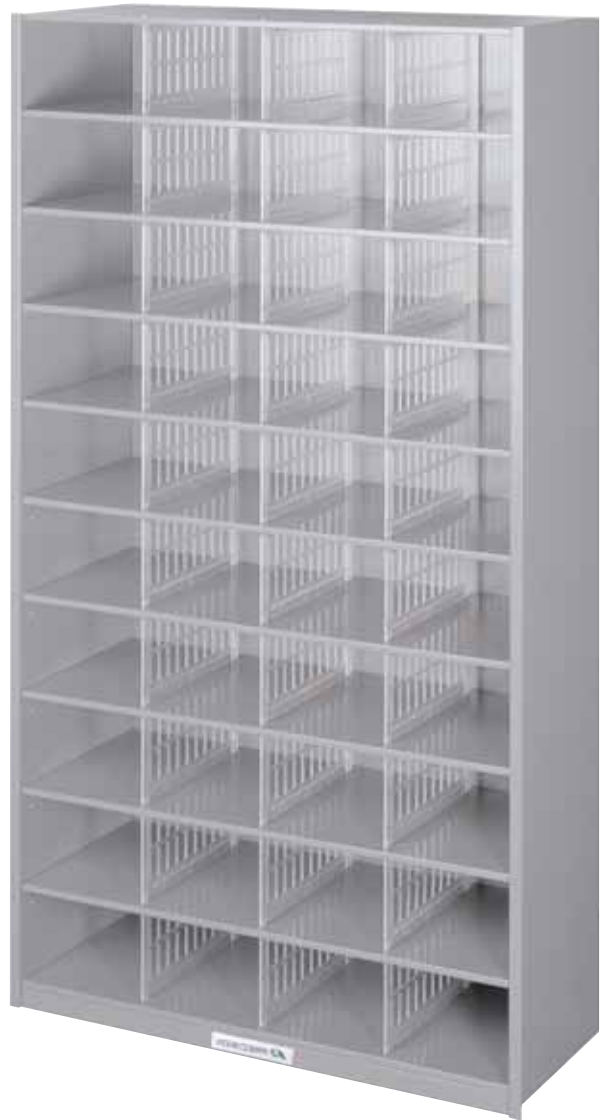
40 hole unit

20 Hole 1037w x 386d x 940h 40 Hole 1037w x 386d x 1825h